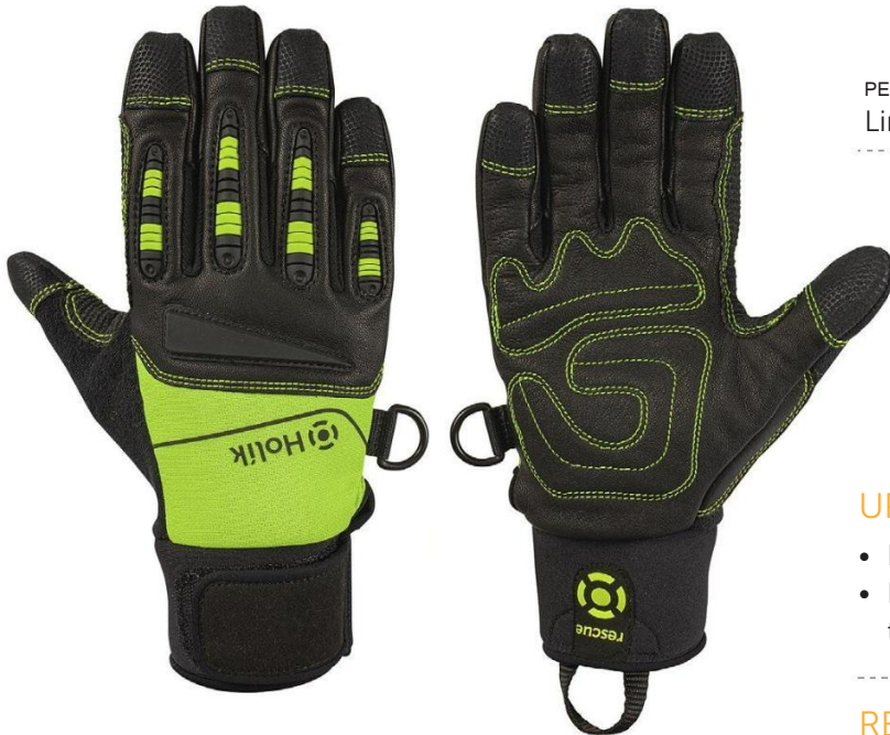
PENELOPE Plus 6517 Lime green

A very popular model among rescue gloves. Comfortable handling, mouldability and joint protection - these are the main features that play a primary role in the selection.